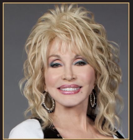
Up Close and Personal Interview with SuperStar Dolly Parton